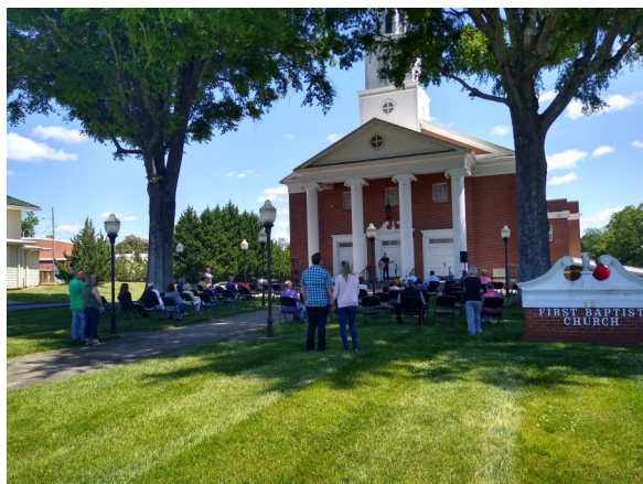
Looking South on S. Main Street

National Day of Prayer events were cancelled in 2020 due to COVID, but they returned in 2021. See page 3 for photos and details.